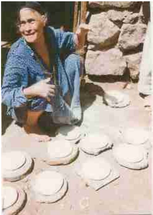
Beni Suef shamsy bread

Leavened breads included the shamsy bread which is allowed to ferment in the sun (shams) and is much like San Francisco sour dough bread.