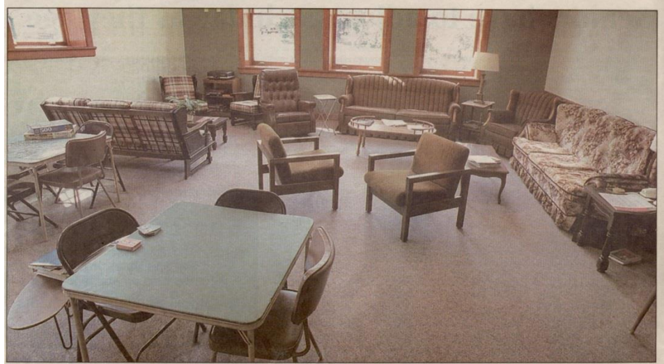
The new Moscow Senior Center is furnished with donated furniture. The above photo shows all but one-third of the center, where there is a coffee pot, computers, and a smaller room used for wellness checks and the Retired and Senior Volunteer Program.

Friendly Neighbors Senior Citizens, Inc. is a non-profit organization, recognized by the IRS as a 501(c)(3) charity. Donations to Friendly Neighbors are deductible under Section 170 of the Code.