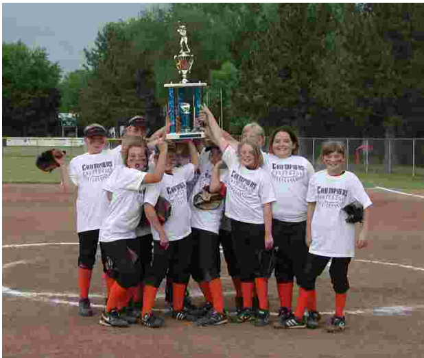
Troy School’s Girls’ Softball Team 2007 -- 2008