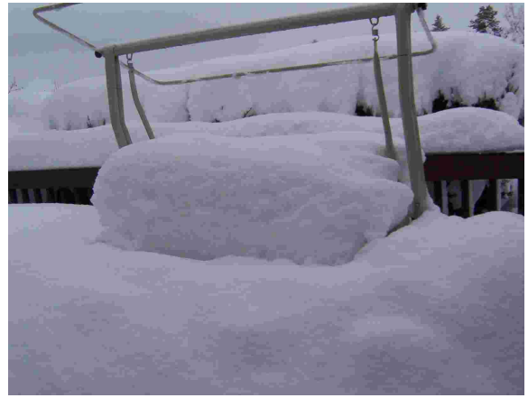
A Little Reminder of Winter 2008 Doris Norman’s Back Deck